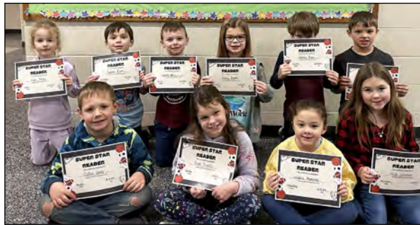
December's Readers of the Month

As the temperatures dropped and the snow began to fall, our local bookworms were just getting warmed up! Leonard Elementary is proud to announce our Readers of the Month for the winter season.