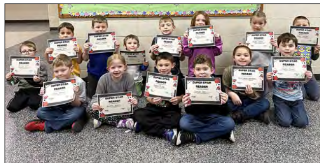
January Readers of the Month

For December, we recognize 1 student from each class: Young 5's, Kindergarten, First Grade and Second Grade. Despite the holiday hustle and bustle, our December Readers of the Month managed to devour their favorite books.