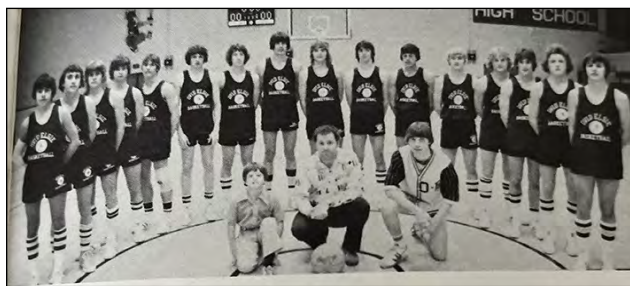
1977-78 Boys Basketball Team