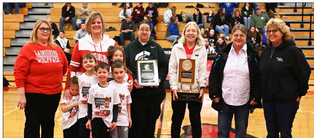
Players from the 1978 State Champion Wolfpack softball team in attendance at the Laingsburg vs Bath Basketball game.

1978 State Champion Wolfpack Feted for Induction into Lansing Sports Hall of Fame March 2, 2025