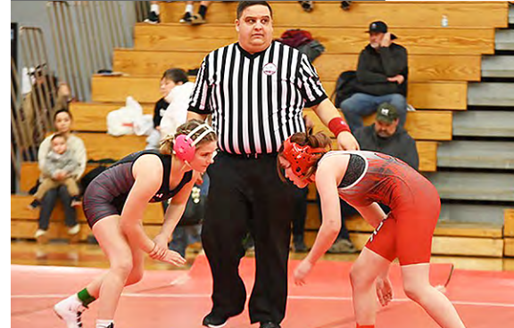
Laingsburg wrestlers facing off during the double dual on January 7th.