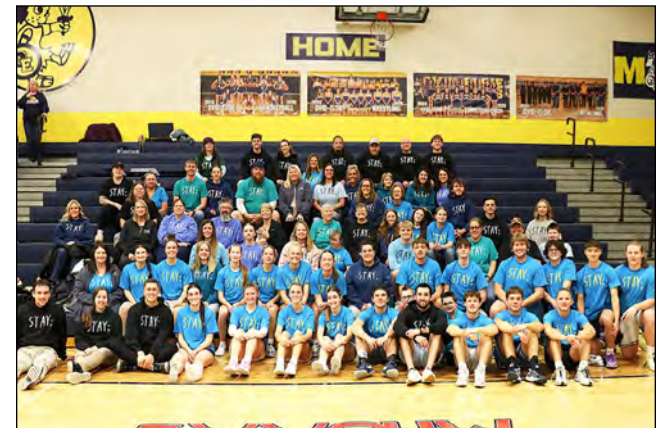
The Ovid-Elsie Girls Basketball team held their annual Mental Health Awareness Night on January 9th during the game against Morrice.