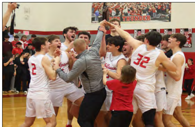
Repeat District Championship: The Laingsburg boys celebrated a Back-to-Back 2nd District Championship win by defeating the Stockbridge Panthers on March 1st 57-45. The Wolfpack lost in a regional game against Jackson Lumen Christi.